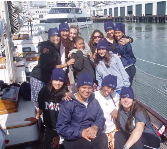
The Girls Summer at Sea 2007 crew arriving home at Pier 40

As a new teacher to the Tall Ship Academy, I found myself as much a student as an educator this past summer. Having just finished the school year a week earlier, I was amazed at how energized and ready I was to begin this new adventure.